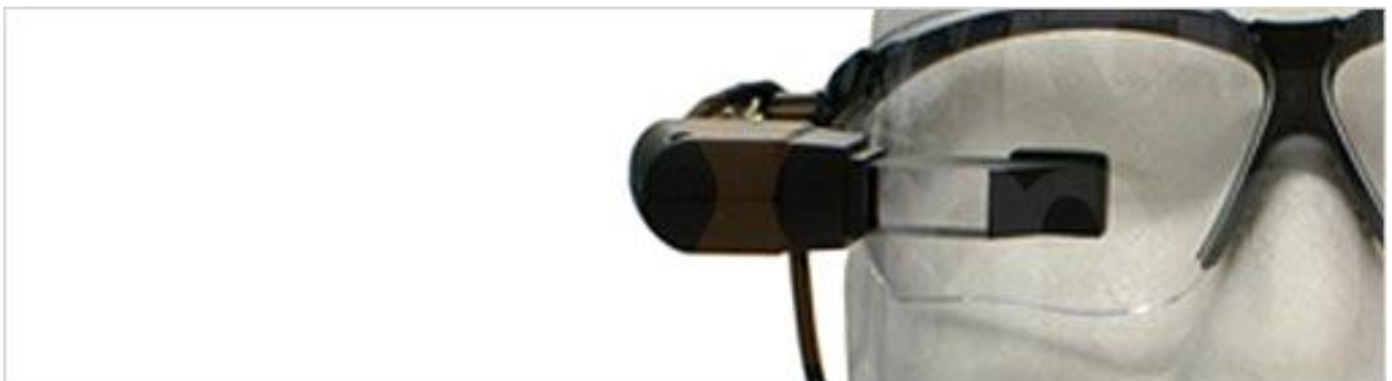
Example of light weight monocular display

When completing a group version, the system is configured to display the activities of the group or each member of the group.